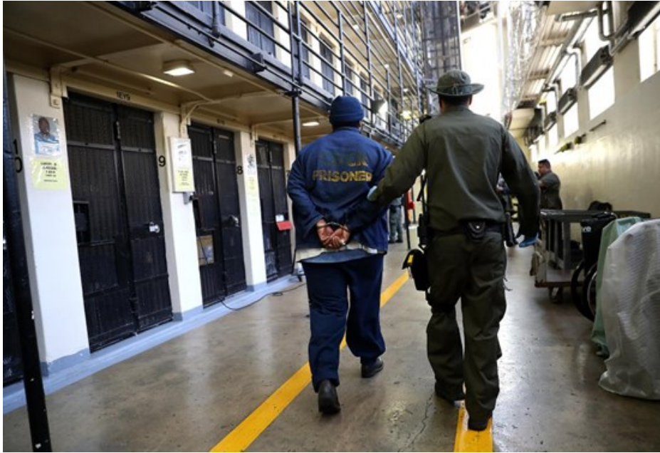
A prisoner escorted by an officer to his cell.