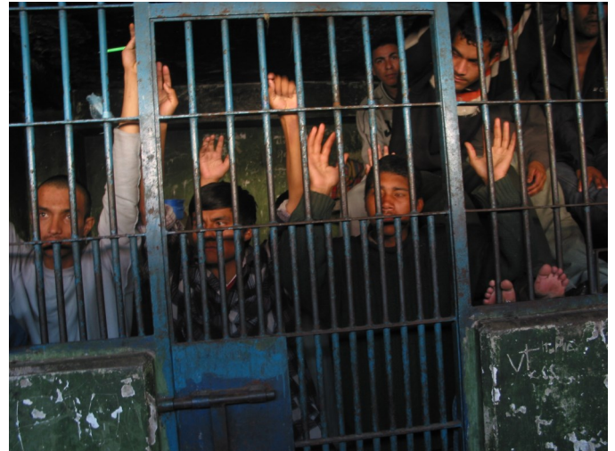
Inmates in a Solitary Housing Unit in Lima, Peru at the Lurigancho Prison.